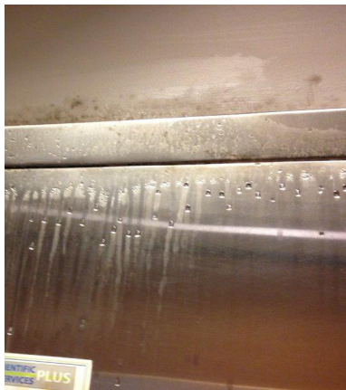
Figure 2. Visible condensation on cold room door.